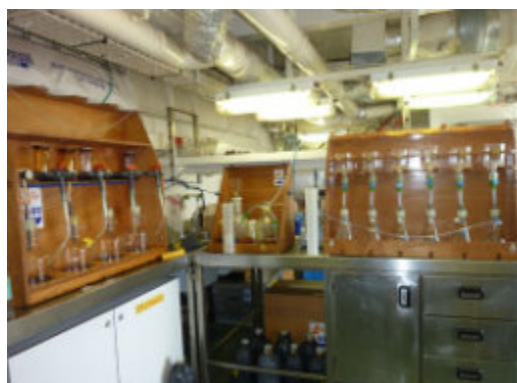
Water filtration set-up in wetlab.